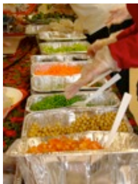
Healthy fruits and vegetables are offered daily at Beye and Irving.

Oak Park School District 97 (D97) voted to extend its pilot healthy lunch program at Beye and