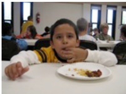
On a journey to Egypt, a Longfellow 2nd grader enjoys a fiber and vitamin-packed couscous stew from North Africa.

This fall Seven Generations Ahead's (SGA) gardening partnership with the Longfellow PTO Greening Committee and Growing Power